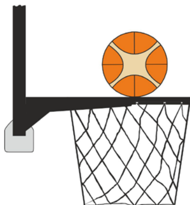
Diagram 2 Ball in contact with the ring